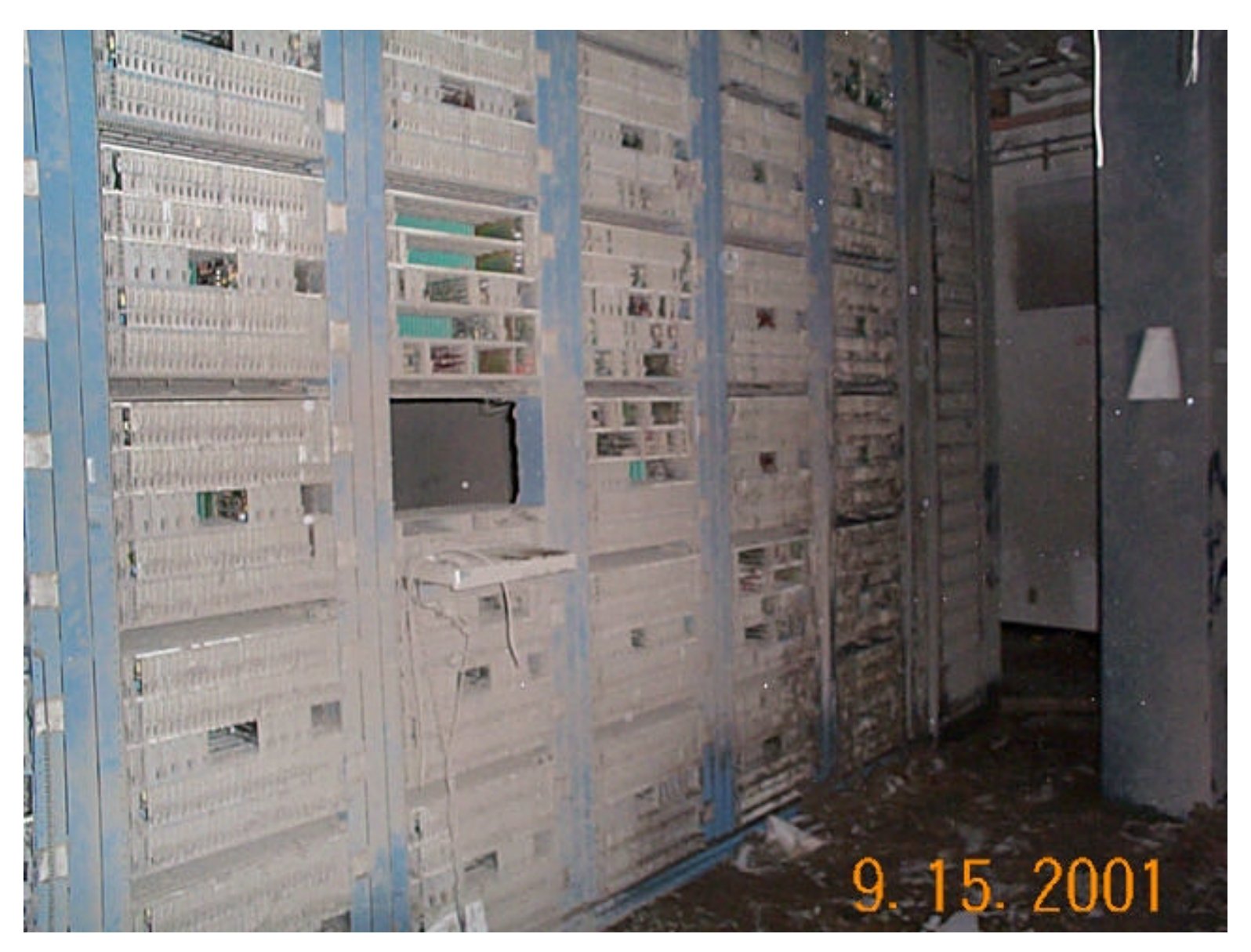
Access equipment 4<sup>th</sup> flr.