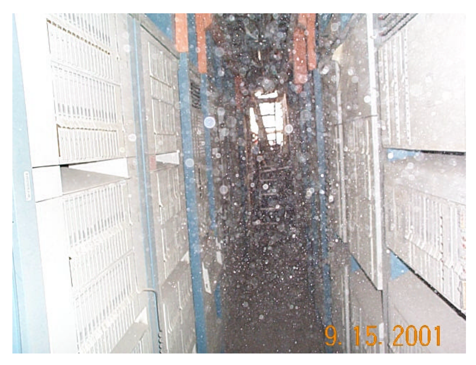
DACS III & IV Spots on the lens are from dripping water from above. Note hole in wall At the end of the isle.