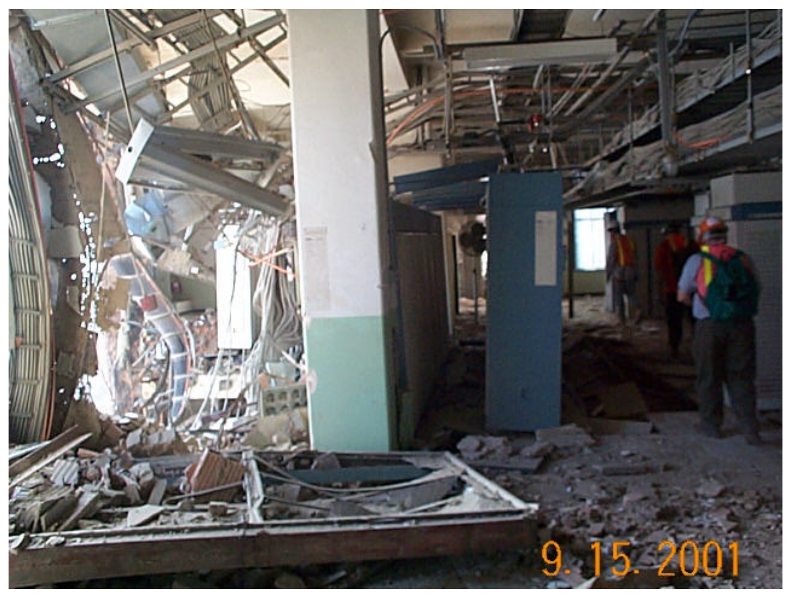
5ESS on the 7<sup>th</sup> floor in the southeast corner.