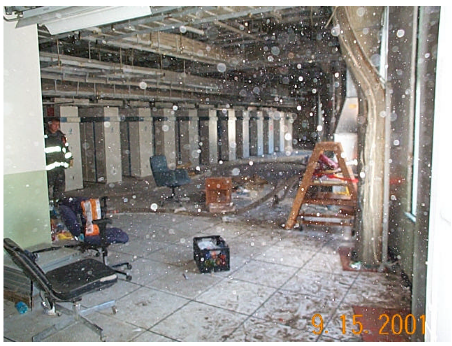
5ESS on 7<sup>th</sup> flr. Note fire hose in ladder at window. Spots caused by water spraying around.